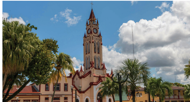
Main plaza & church of Iquitos

Your guide will then take you to Nanay Market & Port where it is said many years ago, the natives came together to found the city of Iquitos. There is also a small but bustling port of peque-peques, colorful wooden watertaxis, where the locals embark to travel to nearby communities. The Nanay market is also a fun place to explore, and your guide will point out typical foods such as marinated suri worms, grilled caiman alligators, tacacho banana balls, smoked cecina pork fillets, and natural fruit juices such as camu camu and cocona.