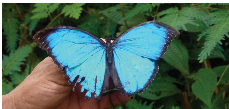
Learn all about butterflies and other jungle creatures at Pilpintuwasi

Just next to Pilpintuwasi is the Amazon Animal Orphanage. Here, the team works hard to save and rehabilitate animals that have been rescued from serving as pets or food. Favorites are the anteaters, monkeys, tapirs, jaguars, macaws, and more.