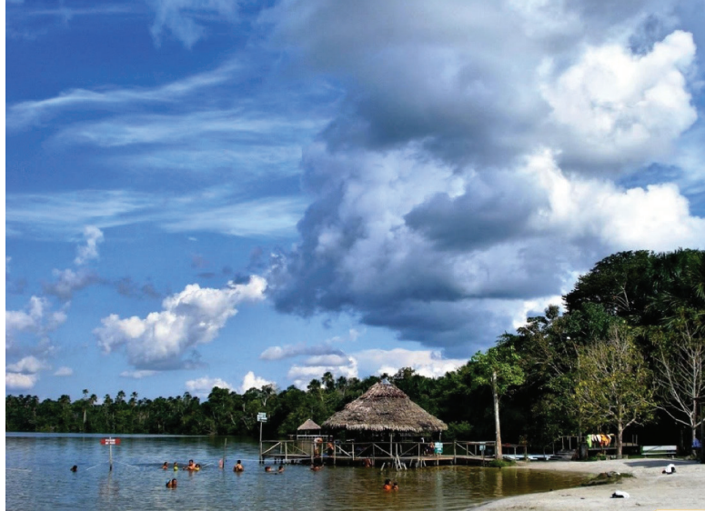
Tunchi Beach is a popular place to cool down

About 6.3 kilometers (4 miles) outside of Iquitos is a place where you can see many rare animals found in the Amazon Rainforest surrounding you. Its name comes from Quistococha Lagoon on the premises and creatures such as jaguars, ocelots, and marguay (big cats!), various monkey species, giant arapaima fish, and other animals call this their home. The serpentarium brings creepy crawlies to you, and at the aviary there are lively birds of all sizes and colors. Should the hot and humid jungle climate reach too deep into your skin, you might not be able to resist a dip at Tunchi Beach! The calm artificial lake beach is fenced for protection and is a pleasant oasis. Fishing and kayaking is also offered at Quistococha. This is a great destination for the whole family!