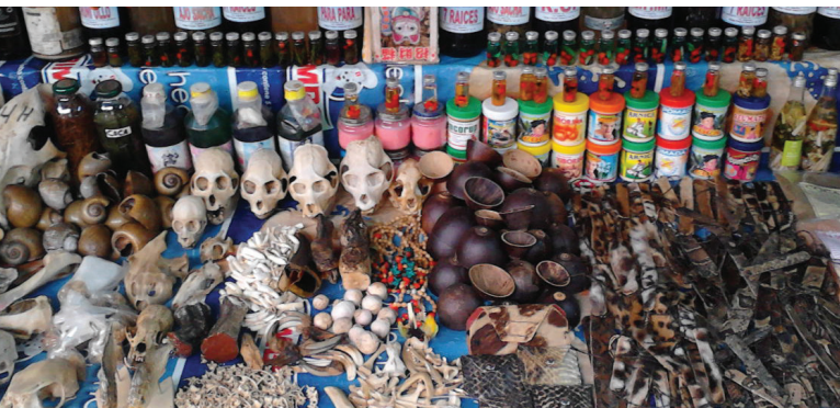
Belen floating market

After a short air-conditioned ride, you will find yourself in Belen floating market (high water season November to May). In this distinctive neighborhood, the people live in stilted homes which anticipate the rising and falling of the river throughout the seasons. During the high water season, wooden bridges link all of the homes as if a maze. The market itself gives many insights into life in Iquitos and Amazonia since this is where people come from around the region to both buy and sell food and goods. The fish section allows you a peek at the river creatures that lurk beneath the surface, and not to be missed is the "witches market" full of jungle potions, where your guide will explain some unique cultural beliefs.